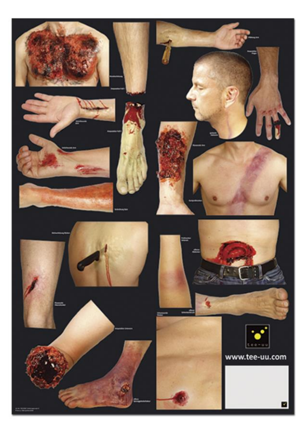
overview variety of injury patterns