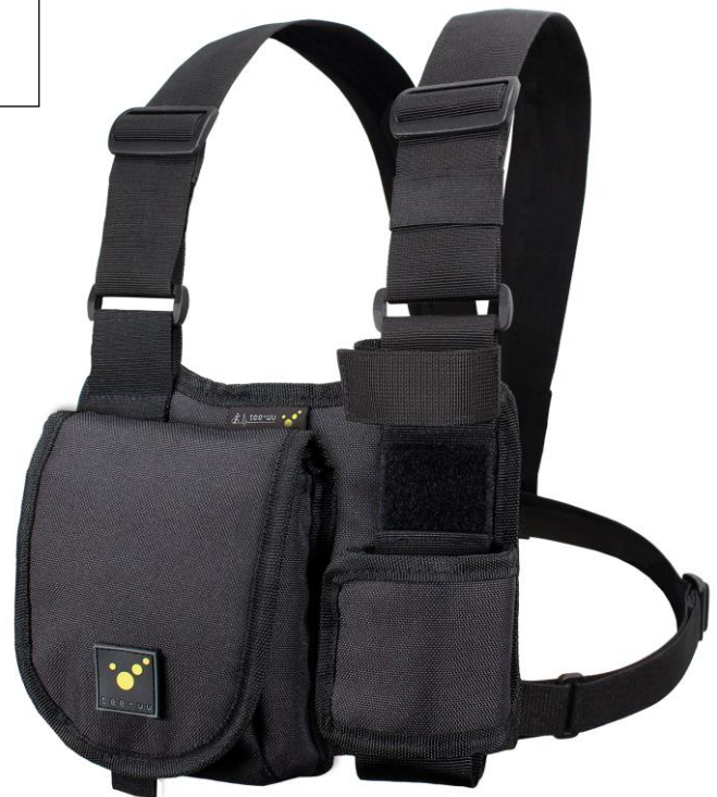
CHEST MOLLE radio harness