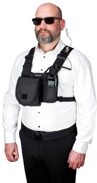
use case: CHEST MOLLE with radio, without TEE-UU logo