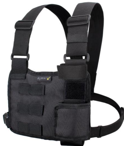
CHEST MOLLE without main compartment (detachable holster)