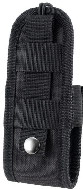
rear: PALS loop system with metal snap fastener