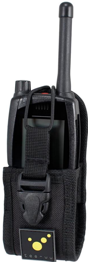
use case: COM TAC with digital radio