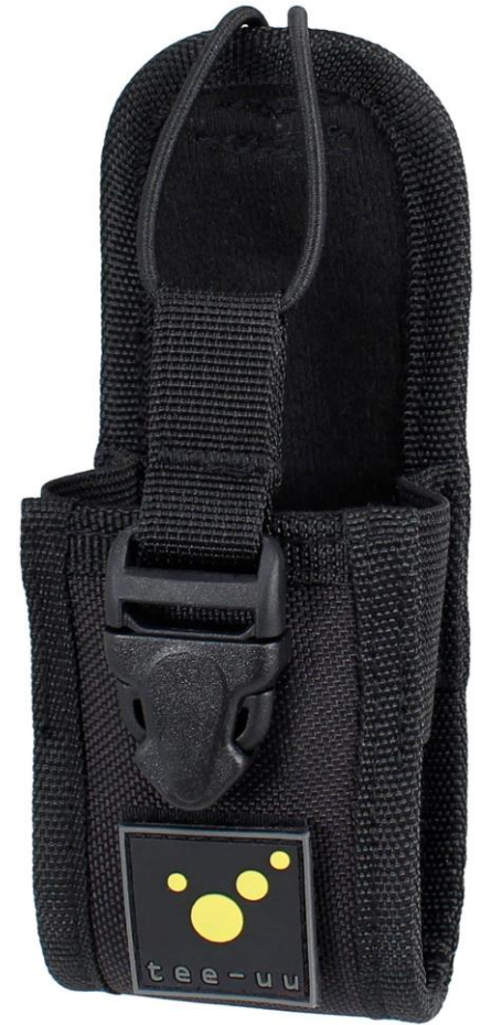
COM TAC holster