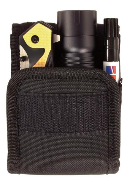
use case: DUPLEX TAC with SNAP rescue knife and additional equipment