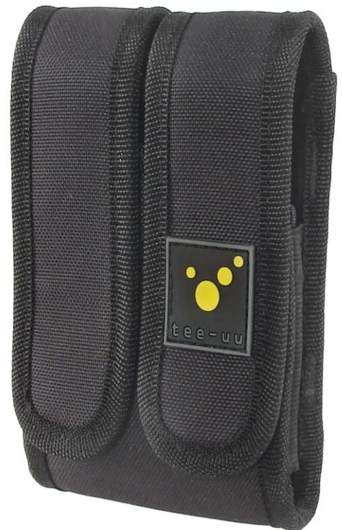
DUPLEX TAC holster