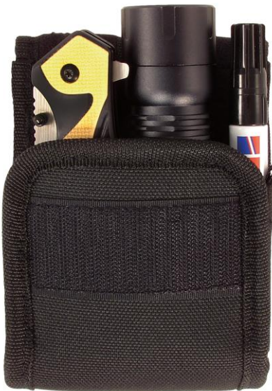
use case: DUPLEX TAC with SNAP rescue knife and additional equipment