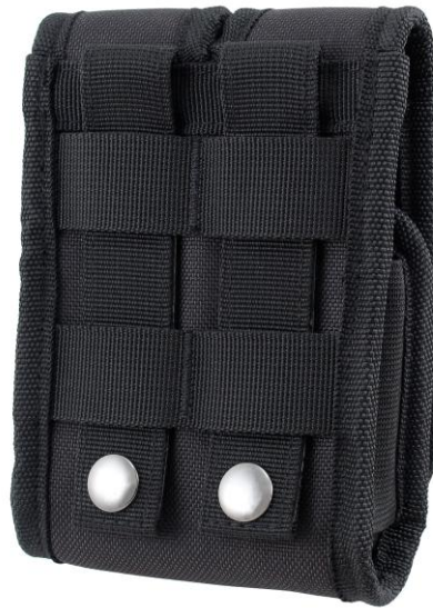
rear: PALS loop system with metal snap fastener