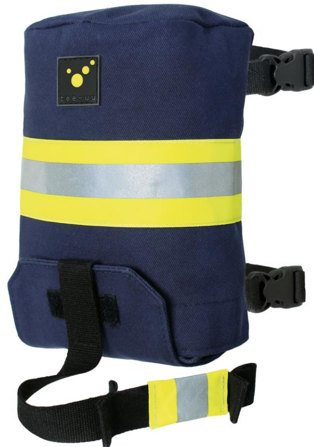
ESCAPE XL Escape Hood Holster