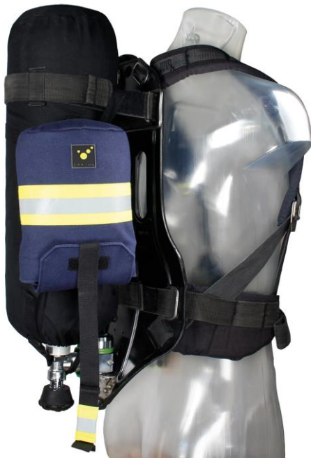
Use case: ESCAPE XL mounted at SCBA