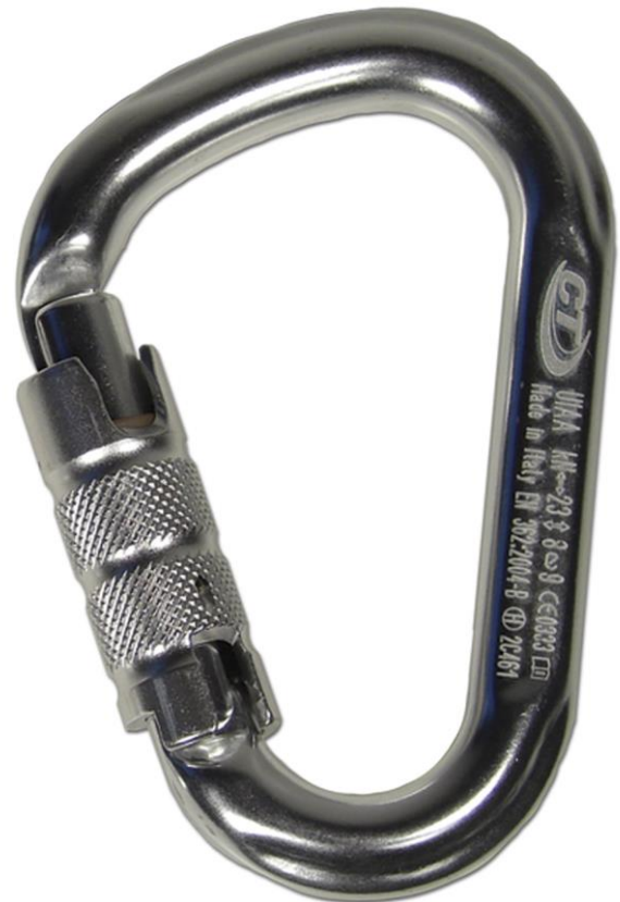
HMS SAFE-LOCK Carabiner