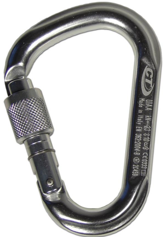
HMS SCREW Carabiner