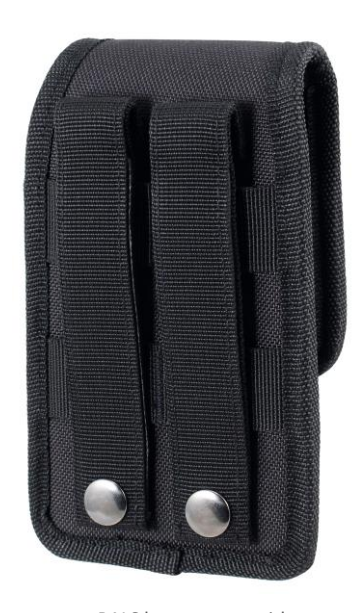
rear: PALS loop system with metal snap fastener