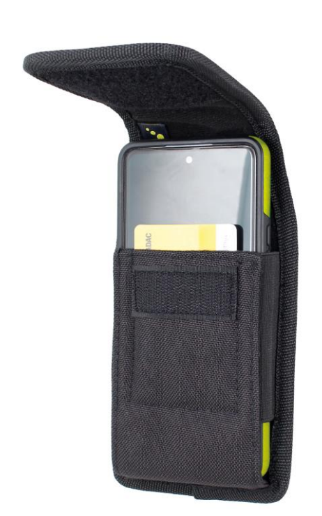
use case: MOBILE TAC with smartphone and (credit-)card