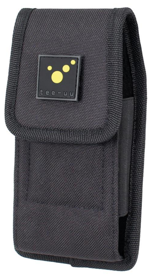
MOBILE TAC holster