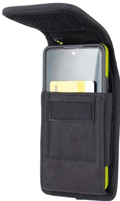
use case: MOBILE TAC with smartphone and (credit-)card