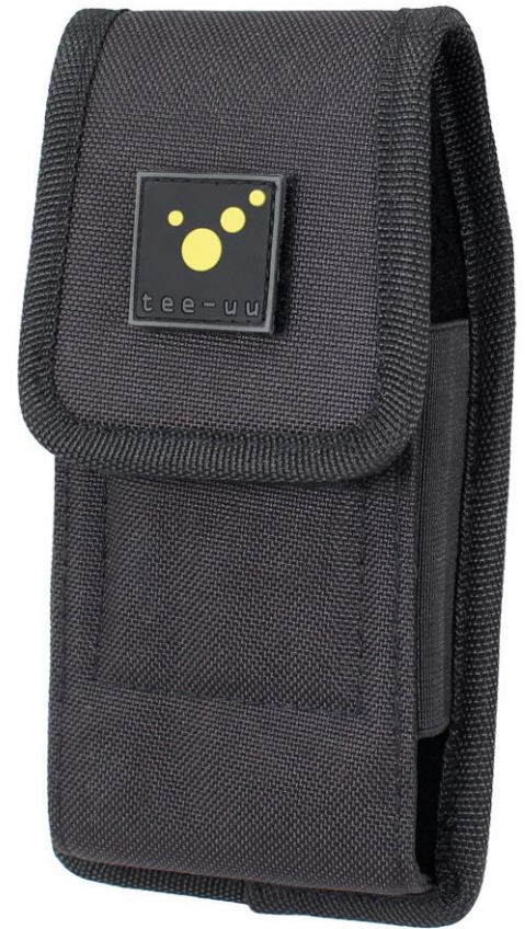
MOBILE TAC holster