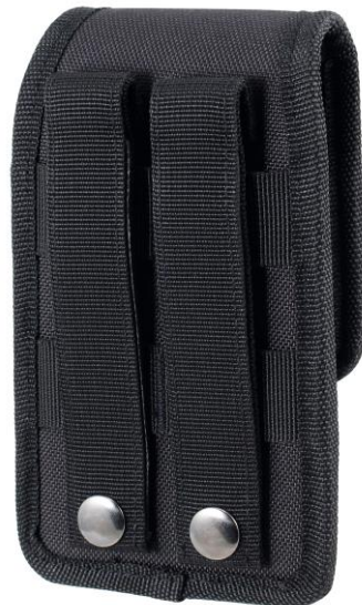
rear: PALS loop system with metal snap fastener