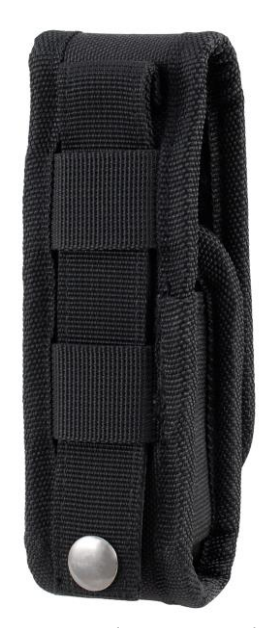
rear: PALS loop system with metal snap fastener