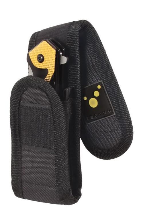
use case: SINGLE TAC with SNAP rescue knife