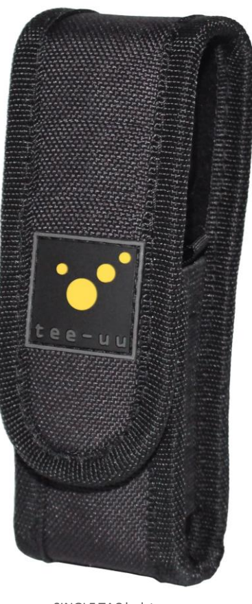
SINGLE TAC holster