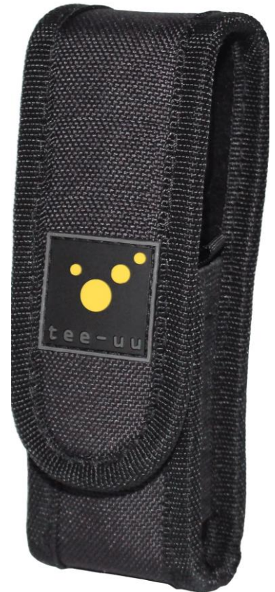
SINGLE TAC holster