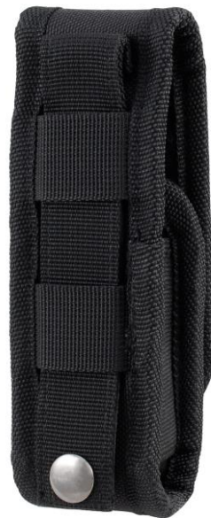
rear: PALS loop system with metal snap fastener