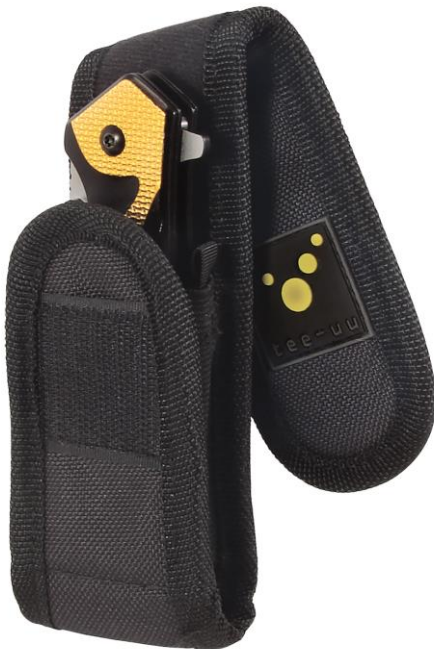
use case: SINGLE TAC with SNAP rescue knife