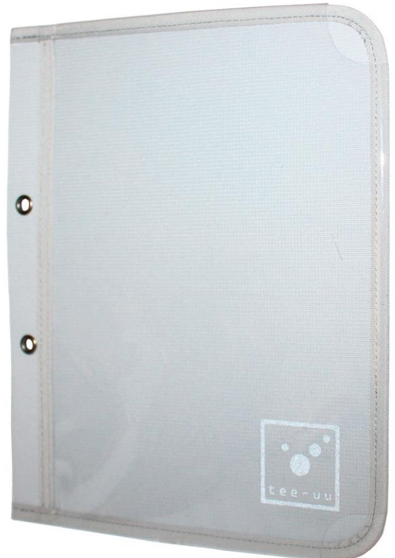
TABLET-FLAP filing solution for tablet-PC